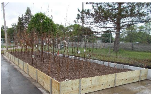
Figure 3: Community gravel bed in Robbinsdale, Minnesota

Gravel bed bare root trees are those which have at some point during the same season of their planting been held in a community gravel bed of whatever form, a technique which is utilized to not only store bare root trees until the time of planting, but also to stimulate additional fine root development in the trees. Both forms of bare root trees are easy to handle as they are relatively