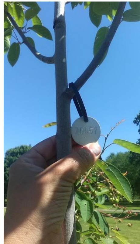
Figure 1: A serviceberry tree included in the study in St. Paul sporting its identifying tag

The myriad benefits of urban forests – ranging from social to economic to environmental – continue to be studied and recorded as our understanding of them is ever expanding. As we gain more insight into how maintaining a vigorous urban forest serves our communities, more and more municipalities and counties are putting forth a concerted effort to grow and enhance their urban greenspaces. These communities often face limited budgets though, so the question of cost effectiveness emerges. How can communities ensure that the investments they are making in the development of their urban forest are going to reward them the most benefits possible? This question requires a complex and multi-faceted answer, informed by many locally unique factors, as well as it includes a consideration of what planting stock options are best suited for their planting events. The three-year Cost Benefit Analysis of Planting Stock intends help communities decide which planting stock types they might prefer to use under a variety different circumstances.