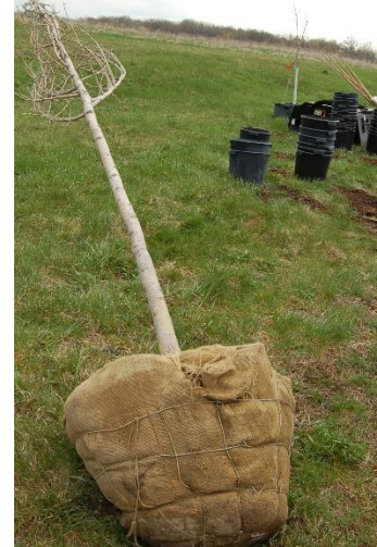
Figure 2: B&B tree before planting

Containerized trees are the most well-known planting stock. They are ubiquitous in nurseries and garden centers, and many species are grown as containerized trees. While there is some variety in container types, all of the containerized trees included in the study were planted out of traditional black containers with fully sealed sides. Containerized trees have a wide range of purchase prices, but generally, pot-size (#5, #10, #15, etc.) is the major factor contributing to the price. Containerized tree prices for can run from around $40-$250 per tree depending on species and size. Handling these trees may also require a fair amount of labor and transportation costs, particularly when trees are in larger pot sizes as they can be very heavy and require a fair amount of knowledge regarding best planting practices.