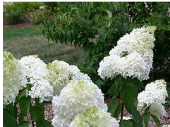
Figure 1 Panicked hydrangea