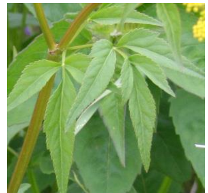
Figure 15 leaves of golden Alexanders