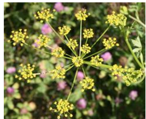
Figure 12 wild parsnip flowers

The concern over this plant is two-fold. It is an aggressive plant that produces large numbers of seed. It is showing up as large colonies along roadsides and in other out-of-the-way places. I have also seen it in State parks and other native areas (wild parsnip is a non-native plant). There is also a human health concern as contact with the sap of this plant can lead to a