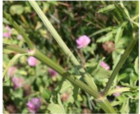
Figure 13 wild parsnip stem

http://www.illinoiswildflowers.info/weeds/plants/wild_parsnip.htm