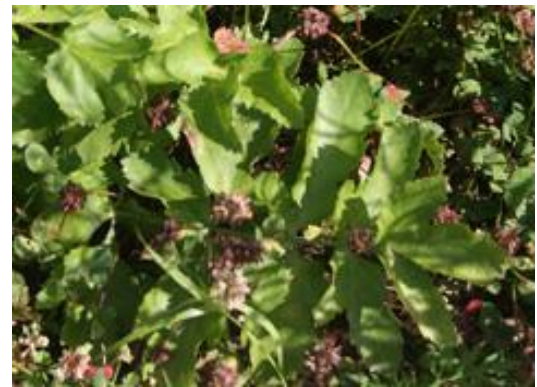
Figure 14 wild parsnip leaves