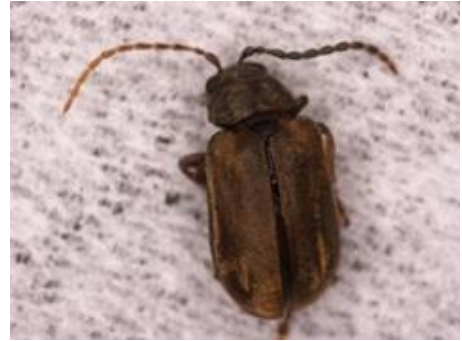
Figure 2 Viburnum leaf beetle adult

Adults emerge from the soil (early July) and chew on the leaves. Their feeding damage forms irregular round holes in the leaves. The beetles are about ¼ inch long and generally brown in color (fig. 2). On close inspection golden hairs can be seen on the wing covers of the adult beetle. The adult beetles will be mating and laying eggs from summer into fall. There is one generation of the beetle each year. Heavy and repeated defoliation by the viburnum leaf beetle can lead to death of the shrubs.