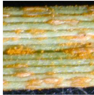
Figure 6 spores of lawn rust

Orange spores are coming to a shoe near you, courtesy of rust on the lawn. This disease generally shows up in July and August when the grass slows its growth due to heat and dryness. The slow growth of the turf allows the disease to attack the grass. Lawn rust is caused by a Puccinia sp. All turfgrasses can be infected by many different species of rust fungi, and Kentucky bluegrass is one of the more rust-susceptible grass species.