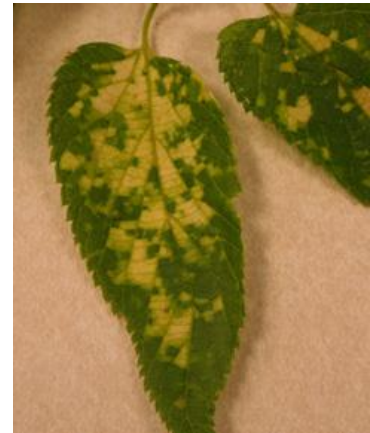
Figure 11 Island chlorosis on hackberry

Usually when we talk about chlorosis we are talking about yellowing of leaves due to nutrient deficiencies. Island chlorosis is thought to be caused by a virus and is showing up on hackberry ( Celtis occidentalis ) at The Morton Arboretum. The symptoms of the viral infection are a mosaic pattern of spots of light green or tan tissue between veins (fig. 11) and some marginal necrosis. The interesting thing about viral infections is that the virus does not want to kill the host, because it needs the host in order to reproduce, but it does make the host weaker and more susceptible to other infections. Since viruses are unable to move on their own, they rely on vectors to move them around. The vectors may be insects, humans, or anything else that can carry the viral particle and create a piercing wound into the host. The only way to prevent a viral disease is to control the vector. Once the tree has a viral disease, it will have it for life. Luckily this one seems to do no real harm to the tree.