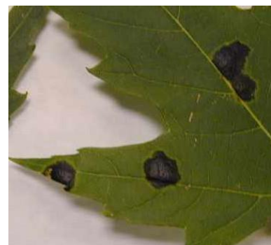
Figure 8 Tar spot

http://www.mortonarb.org/trees-plants/tree-and-plant-advice/help-diseases/tar-spot-maple-rhytisma-spp