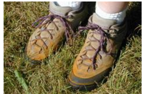
Figure 7 Rust spores on shoes

Management: There is no permanent shoe damage, and the orange spores can be easily wiped off. Lawn rust is usually not severe enough to warrant use of fungicides, and sound management practices will keep this disease in check. Management practices that spur a little growth will minimize rust. These practices include watering and fertilizing with nitrogen. While these practices may apply to a highly managed lawn, they may not be great for the average home lawn. Watering the lawn in summer is not really a priority since the lawn can go dormant and come back when the rain and cooler temperatures return. Fertilizer may be harmful to an unwatered lawn. When the rain returns and the grass grows again, the rust usually diminishes. Some management techniques that apply to any lawn include mowing at the height recommended for the particular turf species and using rust resistant varieties or blends of turfgrass when starting new lawns. For the most part, lawn rust is a relatively minor disease that we can live with.