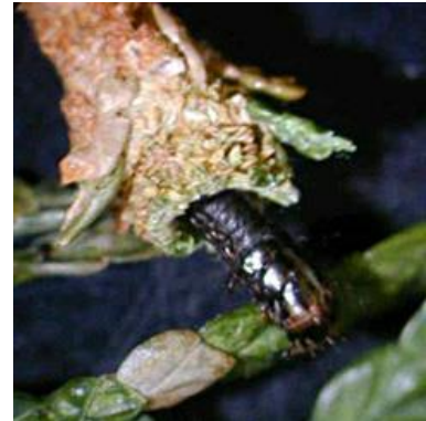
Figure 4 Bagworm caterpillar

The tiny cone-shaped brownish bags are constructed from silk and camouflaged with bits of twigs and foliage from the host plant (fig. 3). Larvae stick their heads and front legs out of the top of the bags to feed and move (fig. 4). The feeding by young larvae results in holes in the foliage. As the larvae grow, they enlarge their bags and feed on the entire leaf, leaving only veins. Bagworm populations can build rapidly and quickly defoliate their hosts. Healthy deciduous trees can usually tolerate three consecutive years of severe defoliation before they are killed. Evergreen trees, on the other hand, are frequently killed by just one year of severe defoliation. Bagworm larvae feed on over 120 species of trees and shrubs. Their bags are made of the foliage they're feeding on, so a bagworm feeding on pine will have pine needles in its bag, while a bagworm feeding on a crabapple will have pieces of crabapple leaves decorating its bag.