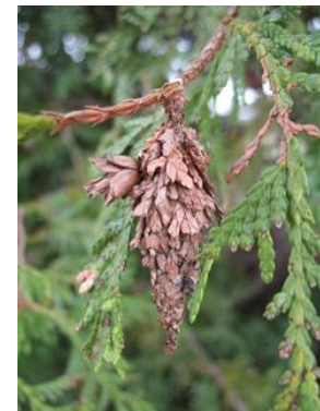
Figure 3 bagworm

Bagworms ( Thyridopteryx ephemeraeformis ) have been reported to the Plant Clinic this week. Bagworms overwinter as eggs inside the female bag. The bag can contain between 300 and 1,000 eggs. The eggs hatch in early summer, and the young larvae suspend from a silk string and are often “ballooned” by wind to nearby plants. When a suitable host plant is found, larvae begin to form bags over their bodies. They move to a sturdy branch, attach the bag with a strong band of silk, and then pupate. By mid-August the larvae have matured and are 1 to 1-1/2 inches in length, and their completed bags are 1-1/2 to 2-1/2 inches long. About four weeks later, adults emerge and mate. The sedentary female, which has no eyes, wings,