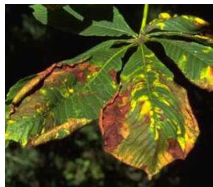
Figure 10 Guignardia on buckeye

https://extension.umaine.edu/ipm/ipddl/publications/5094e/